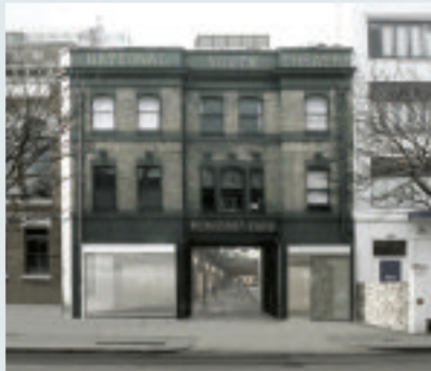
Proposed Holloway Road facades.