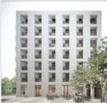
Affordable housing block and rear courtyard.