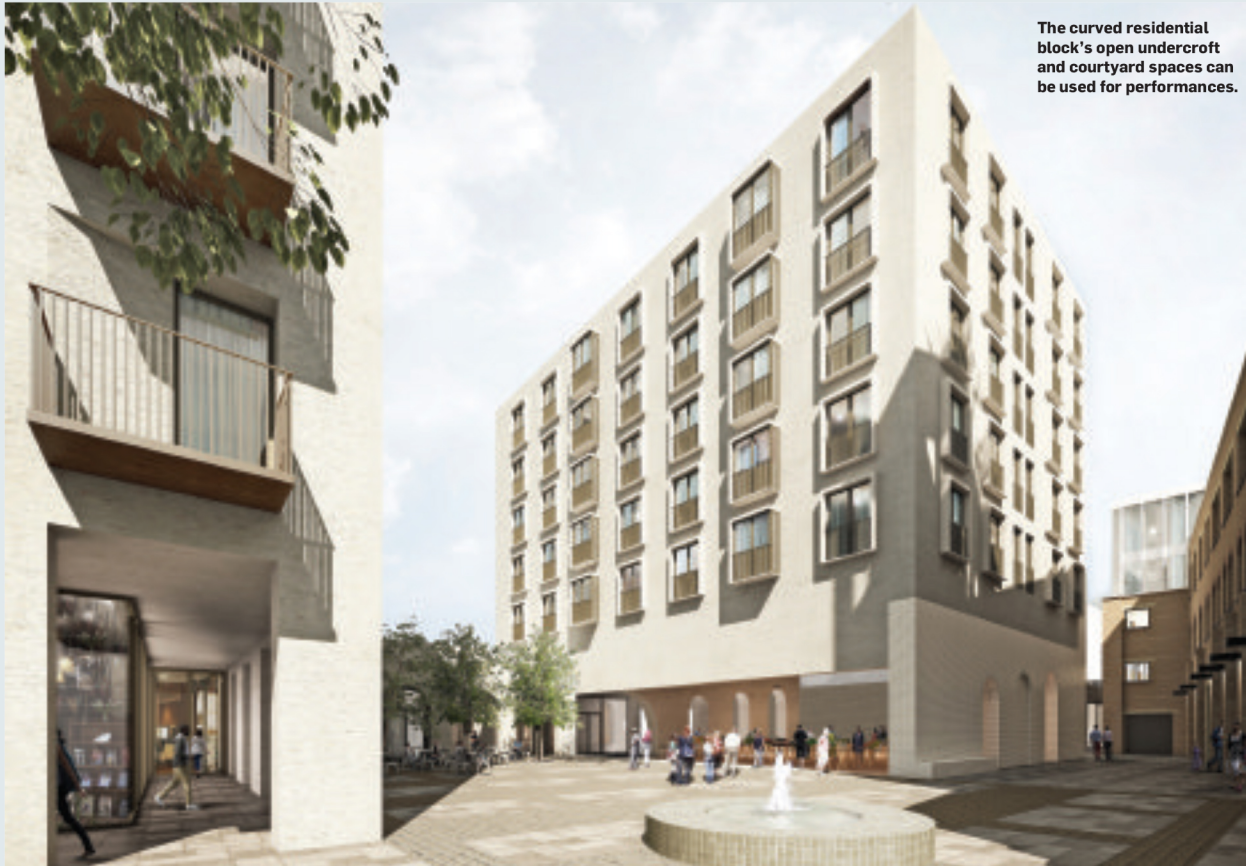
The curved residential block's open undercroft and courtyard spaces can be used for performances.