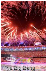
The Big Bang